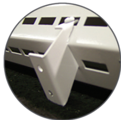
WALL BRACKETS INCLUDED